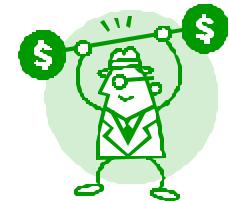
Power & Dollars—and there goes the Town!

no view protection , increasing development formulas. Pending changes include eliminating 2/3 of the off-road pathway easements , selling open space, conservation easements to start at 40% slope rather than 30% slope as stated in the General Plan. And there are more—all will result in significant impact on the rural nature of the Town. Is this what you want? In November you can make your wishes known!