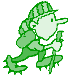
$120 per hour—not bad for walking around Town paths!

At the conclusion of the first Pathways study session, the audience was incredulous when the "hired walker"